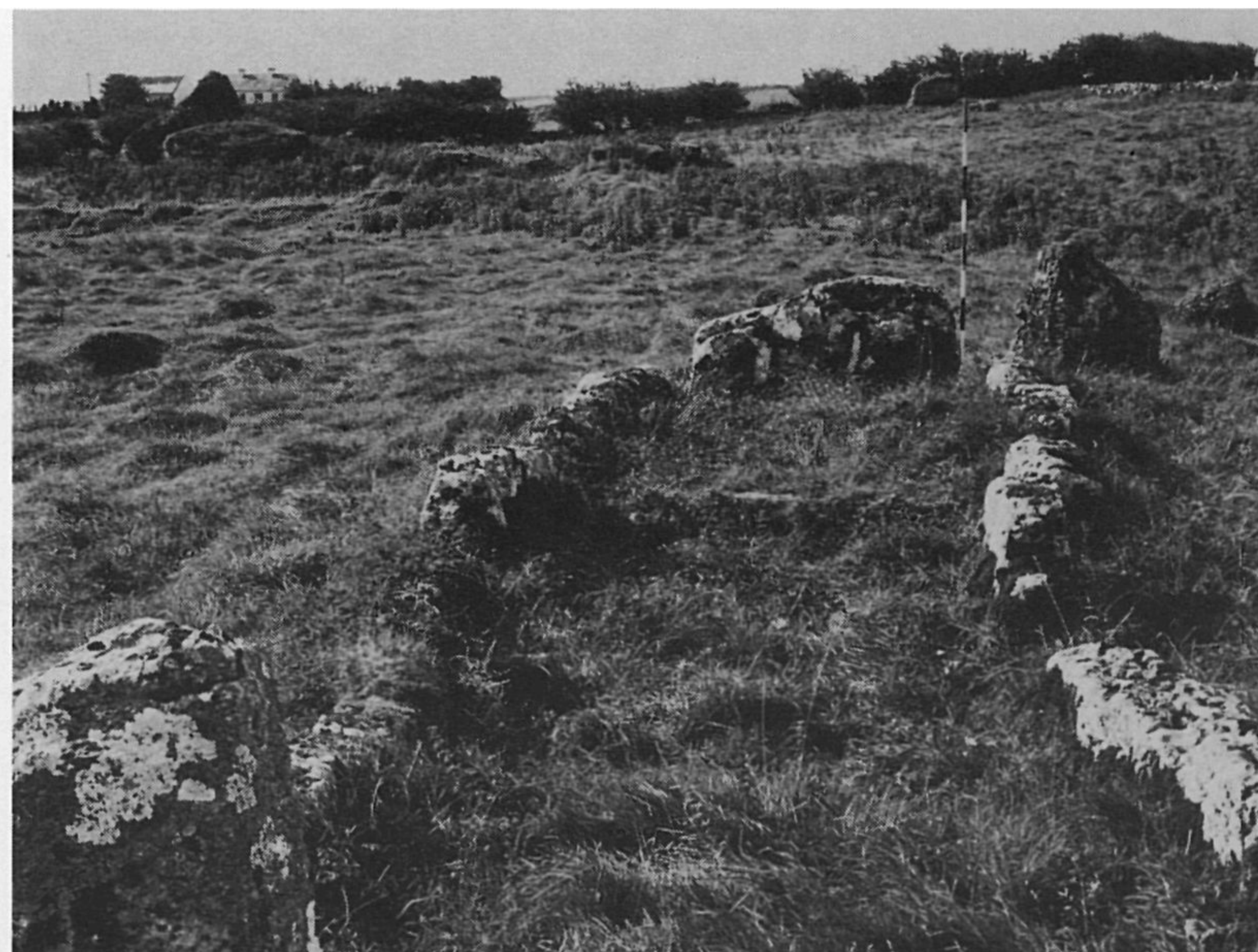
2. Moytirra East (Sl. 110). The back of the gallery, from North-East.