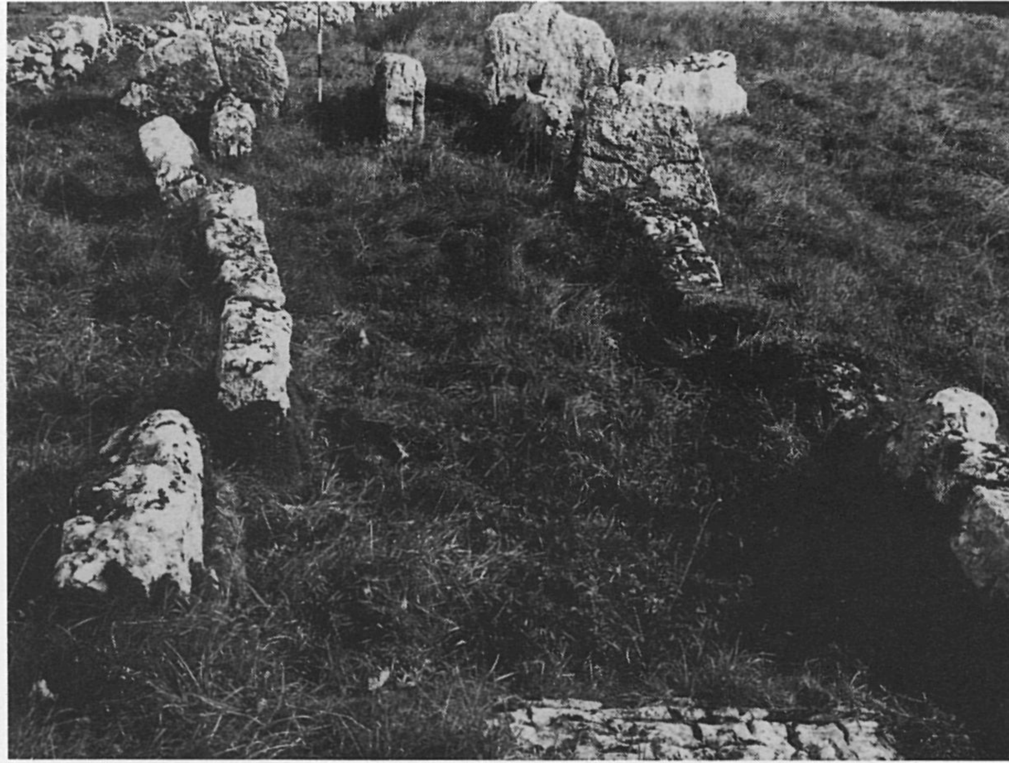
1. Moytirra East (Sl. 110). The front of the gallery, from South-West.